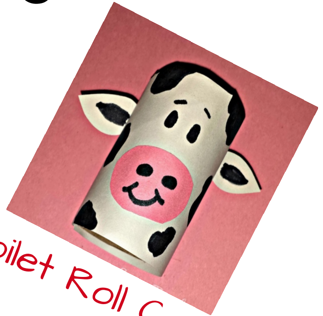
Toilet Roll Cows