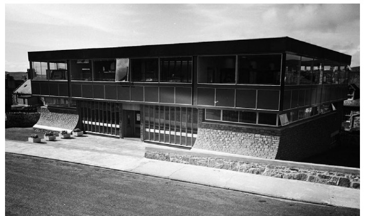
Shetland Museum and Library at Hillhead