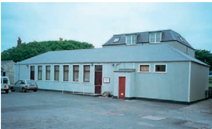
Shetland Archives, King Harald Street

Other events will be listed at www.shetlandmuseumandarchives.org.uk as they are confirmed.