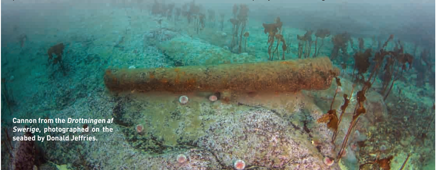
Cannon from the Drottningen af Sverige

This exhibition is set to run throughout 2015.