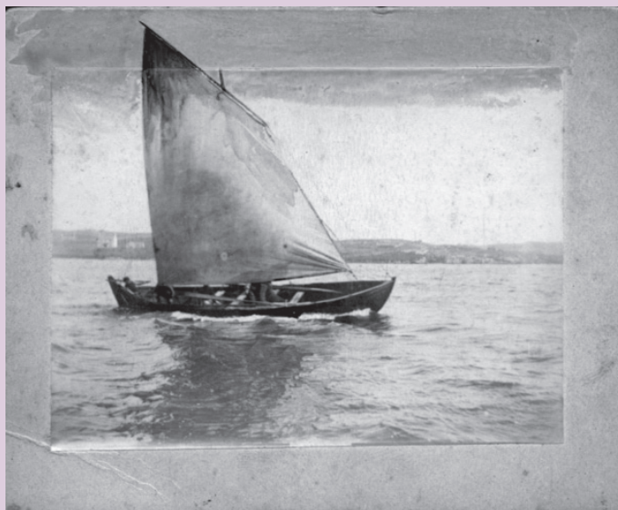
Sixareen Industry racing under square sail at Walls.

As well as personal experiences; the historical facts are equally important. This winter I have spent the majority of my time in the Shetland Archives examining the Bruce of Symbister collection of papers, and these are a few of the interesting things that I have found. It is known that up until the mid nineteenth century timber and wood products came to Shetland from Norway. I was therefore surprised to find that during the eighteenth century large amounts of barrel staves, timber deals, and at least two consignments of oars (one of 48 and the other of 120) came from Hamburg. Another discovery is that boatbuilding in Shetland began earlier than previously