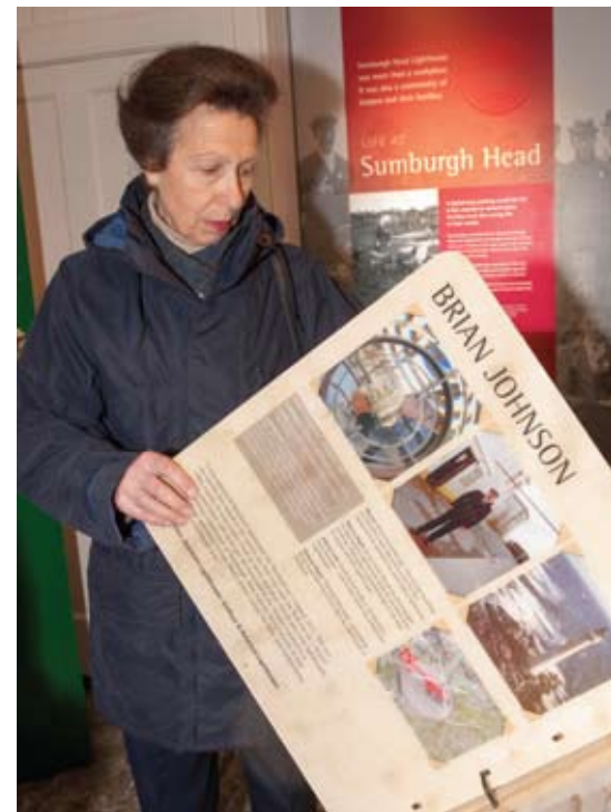
HRH The Princess Royal looks through the book of Lighthouse Keepers in the Smiddy.

The self-catering accommodation at Sumburgh Head has always been very popular and fully booked for the majority of the year before it was closed