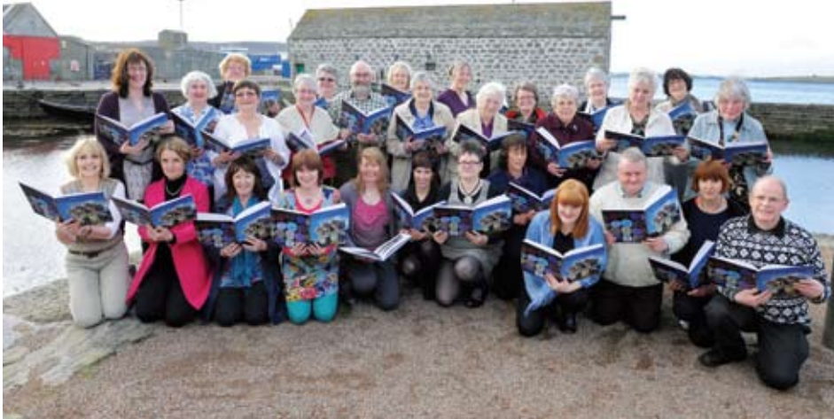
Authors gather outside Shetland Museum & Archives with copies of the book, hot off the press.

Shetland Heritage Publications is pleased to announce the recent publication of 'Real Shetland Yarns' , a collection of personal stories and memories from Shetlanders about their connection to wool and textiles.