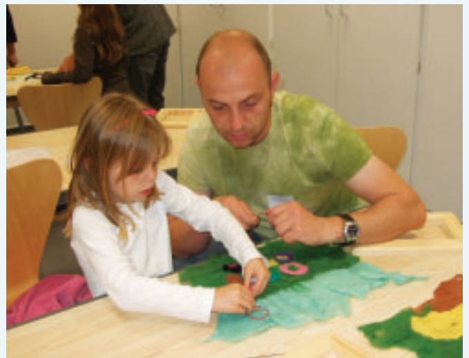
Family fun at a felting workshop.

Details of all the workshops will be in the Summer Activities booklet, distributed through schools in early June. You can also find information on our website www.shetlandmuseumandarchives.org.uk from mid June. Bookings open on Monday 21st June and prices range from free to £8 per workshop.